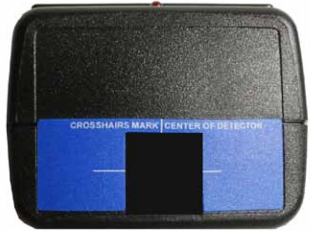
The end panel of the MC1K Shown