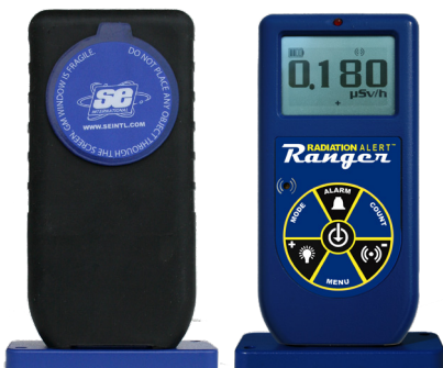
Lanyard, Ruggedized Boot, Detector Cover, USB Cable and Stand Included