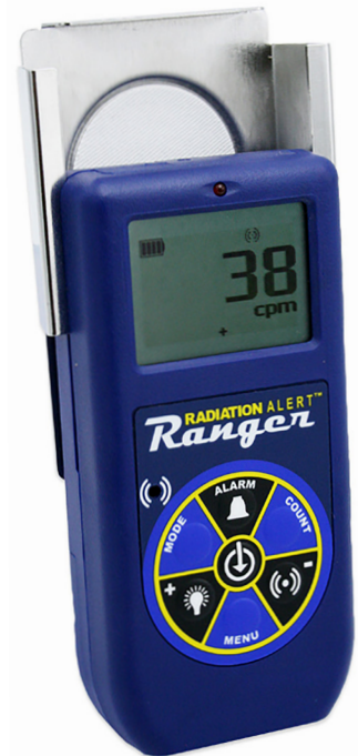
Optional Wipe Test Plate Shown