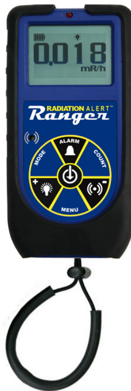
Shown with ruggedized protective boot