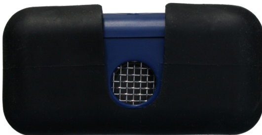
Ruggedized boot and Stand Included